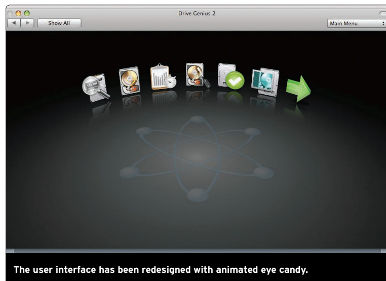
The user interface has been redesigned with animated eye candy.